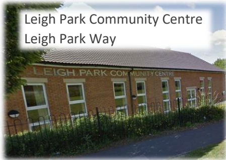
Leigh Park Community Centre Leigh Park Way

Defibrillators will be available round the clock and are used to give a high energy electric shock to the heart through the chest wall to someone who is in cardiac arrest