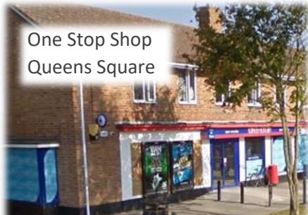
One Stop Shop Queens Square

It will have a monitoring system that will be checked regularly by the Town Caretaker