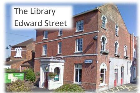
The Library Edward Street

A defibrillator can be used by anyone, you don't need any training