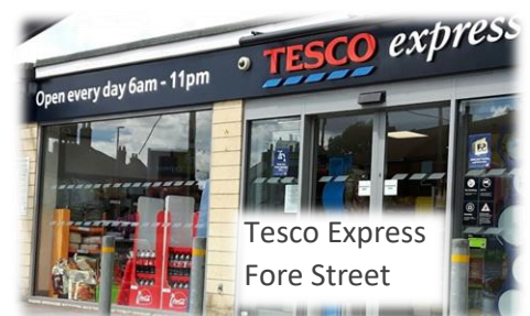
Tesco Express Fore Street

The Town Council have arranged some awareness sessions with Heartsafe and members of the public are invited to attend